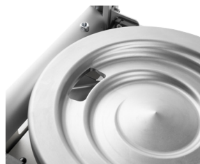
Cylindrical automatic feeder