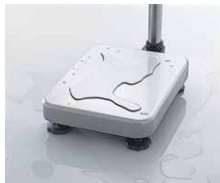
IP65 base unit with a SUS430 pan

In addition to being intrinsically safe, the base unit of the HV-CEP series can be washed with water and can weigh wet objects without problems. Further, the surface of the pan is resistant to chemicals, scratches and rust, and easy to keep clean and hygienic.