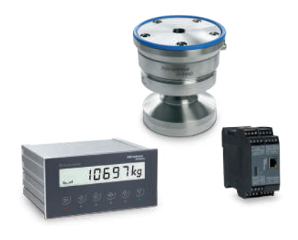
Components and solutions for silo weighing