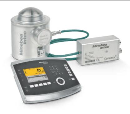
Components and solutions for vehicle weighing (analogue/digital)