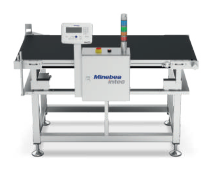
Checkweighers for heavy loads