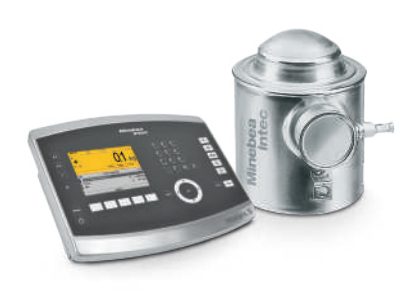
Components and solutions for vehicle weighing (analogue/digital)