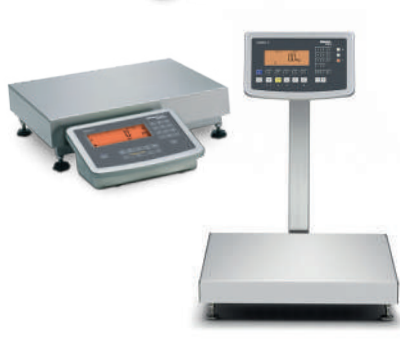
Portioning and checkweighing