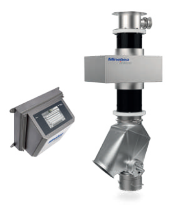
Foreign object detection (metal detection/X-ray inspection)