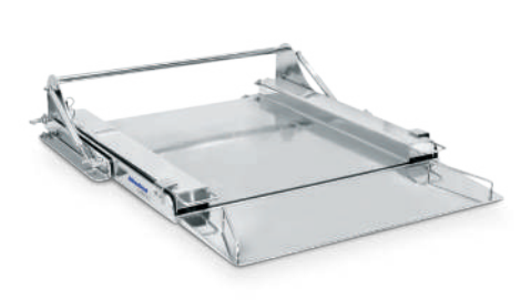
Weighing of incoming goods