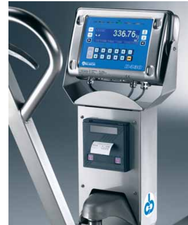
PTM-N IX model with optional printer