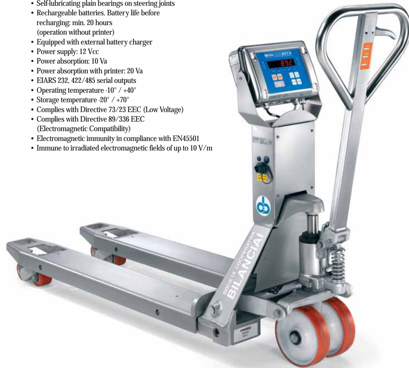
PTM-NE IX model