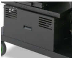
Sealed Lead Acid (SLA)

* Choose power system to complete the solution