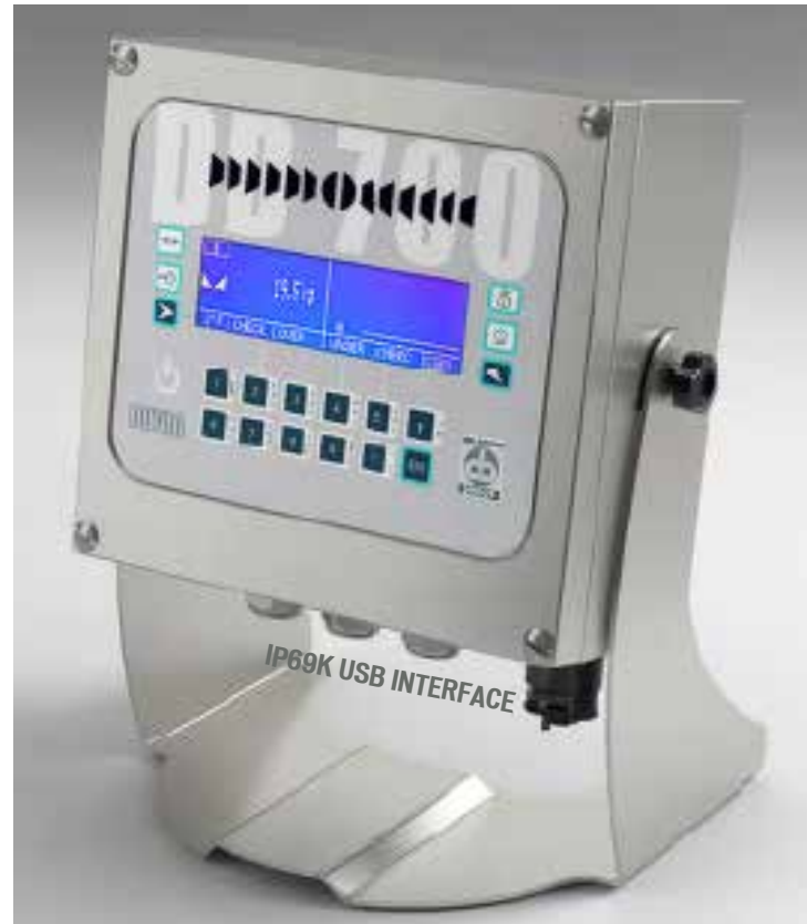
DD700i IP69K VERSION

With standard Checkweighing, TakeAway, Single weighing, Sum weighing, Parts Counting, Grading, Multi-Operator software, Batching (loading/unloading extraction) with Fall and inflight calculation, Display function "Hotkeys", customisable display messages and print layouts, a host of standard printer interfaces and data download via the USB or ethernet the DD700i-ic is industry ready.