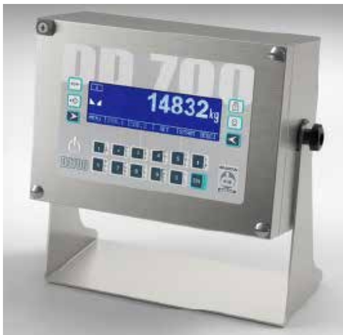
DD700i-ic INDUSTRIAL VERSION