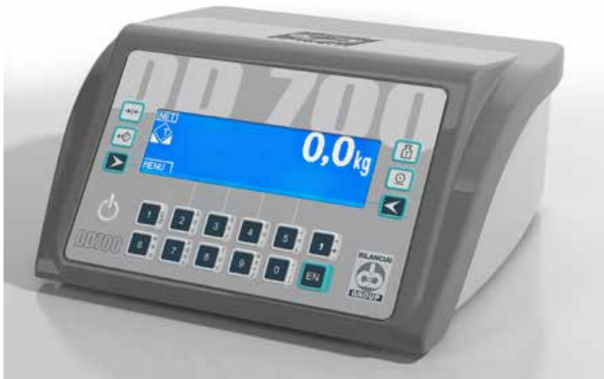
DESK MOUNT VERSION

The alphanumeric keypad or optional USB keyboard simplifies the user experience, making operations more convenient and flexible.