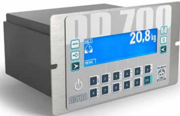
PANEL MOUNT VERSION

With standard Double (Truck In/Out), Single weighing, Batching (loading/unloading extraction) with Fall and inflight calculation, Display function "Hotkeys", customisable display messages and print layouts, a host of standard printer interfaces and data download via the USB or Ethernet the DD700 is industry ready.